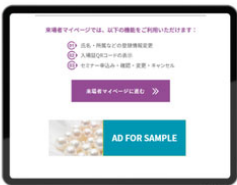
Registration Form Banner