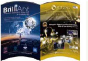
Official Guidebook Advertising