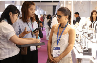
Visitors' Badge Advertising